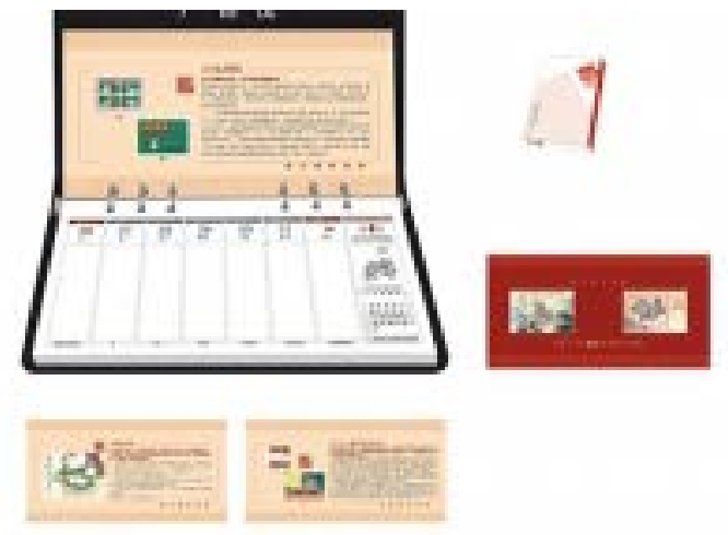
Figure 3 Ideological and political education

improved, the pressure of teachers' scientific research and post should be reduced, and teachers should be given more space to prepare the teaching plan of ideological and political education.[5]. On the other hand, relying solely on professional teachers to carry out the construction of ideological and political team is far less than the participation required by the "big ideological and political ", we should closely link the school counselors, party members and cadres, logistics and other school departments to carry out ideological and political education for college students, fully integrate the breadth and depth of their education, and better improve the standard of ideological and political education.