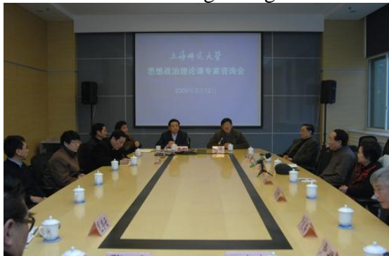
Figure 1 Education concept of "big thought politics"

As an important part of the concept of university education," big thought and politics "essentially puts the ideological and political education of college students in the overall perspective and the fundamental problems, combining" people-oriented, moral education as the first "[1] to improve the quality of ideological and political education among college students as follows: